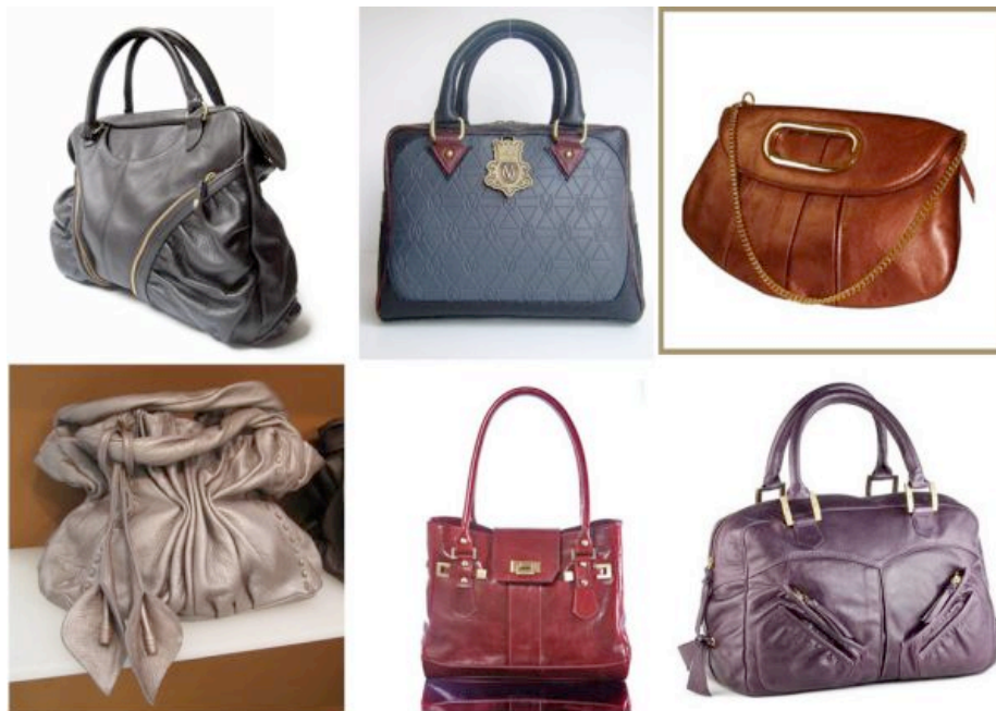
The New "It" Bags: ELEZAR, Fil...