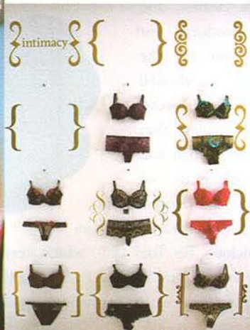
Zuccherò and at right, Intimacy

ZUCCHERO PHOTO BY DANIEL ORTIZ; MORE THAN YOU CAN IMAGINE PHOTO BY FULCON; DAVENPORT, PUCCI PHOTO COURTESY OF GETTY IMAGES